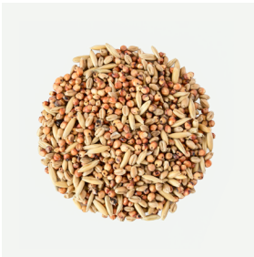
MILO, WHEAT, OATS